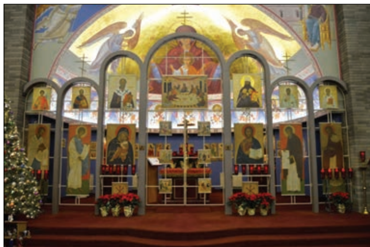
The Byzantine Rite Catholic Churches were permitted to keep the iconostasis — the wall composed of icons to separate the sanctuary from the nave of the church.

Although there is no entrance fee, a free-will offering will be taken up. If you'd like to take an ad in the concert journal to further help the work at Good Counsel, please contact rachelminister1@aol.com or call 845-492-6709. The Marian Shrine is at 174 Filors Lane in Stony Point, 10980.